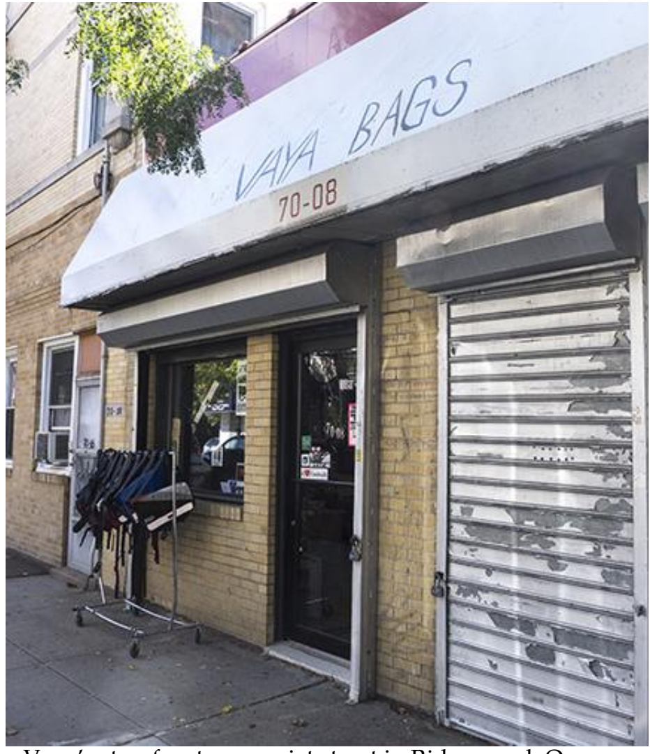
Vaya's storefront on a quiet street in Ridgewood, Queens.

The staff at Bicycle Roots was immediately impressed by the quality of these bags. The materials used were sturdy and would stand up to regular use, the colors vibrant. Even deep-color dyes did not rub off on skin or clothing. The bags' exterior is fabricated from scrap marine canvas (used for sailboat awnings) and/or used bicycle tubes, donated by shipyards and local bike shops, respectively. The bags are lined with truck tarp, ensuring that no matter what you're carrying, your gear stays dry in any weather conditions.